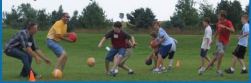
Fathers against sons in dodgeball!

Themes explored this weekend in light of our Catholic faith are our identity as father and son, the father-son bond, becoming a man, communicating from the heart, living our Catholic faith, relating to peers, and vocations as a father and a son: our response to God's call.