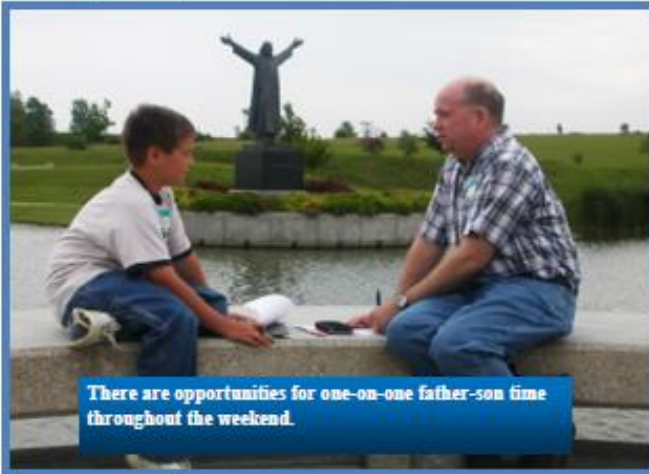
There are opportunities for one-on-one father-son time throughout the weekend.

Come join us for our 14th annual fathers and sons retreat